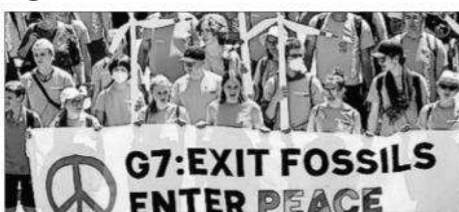
Protesters ahead of the G7 meeting in Munich, Germany

Police said earlier they were expecting some 20,000 protesters in the Bavarian city, but initially fewer people showed up for the main protest which started at noon, the German