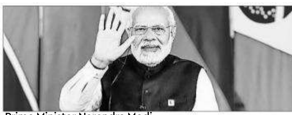
Prime Minister Narendra Modi

Modi is visiting Schloss Elmau in southern Germany on June 26 and 27 for the summit of the G7, a grouping of the world's seven richest nations. The G7 leaders are expected to focus on the Ukraine crisis that has triggered geopolitical turmoil besides fuelling a global food and energy crisis. Modi is